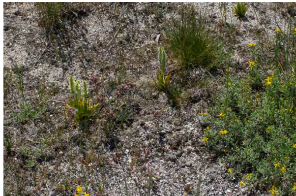
Ladies Tresses, inside boardwalk! (Photo from boardwalk) ( Spiranthes romanzoffiana )