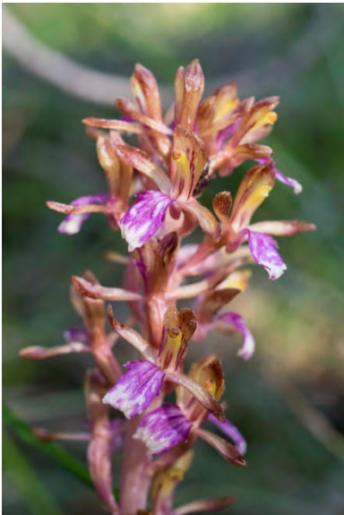
Western Coral Root ( Corallorhiza mertensiana )