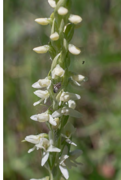
White Bog Orchid with Spider ( Platanthera dilatata )